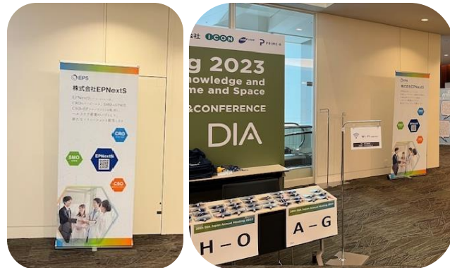
※Stand sample of last year's