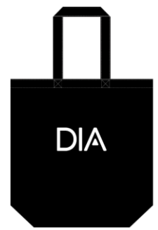
Image of the bag

2. Display the logos of exhibiting companies on the bags 110,000 yen