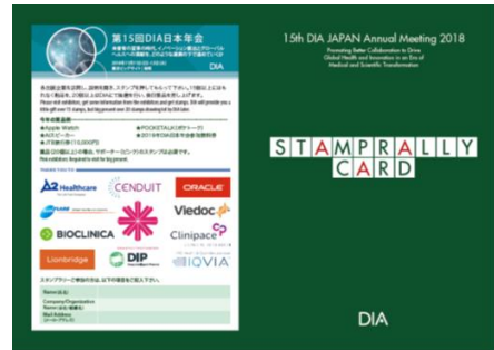
※Card sample of last year's