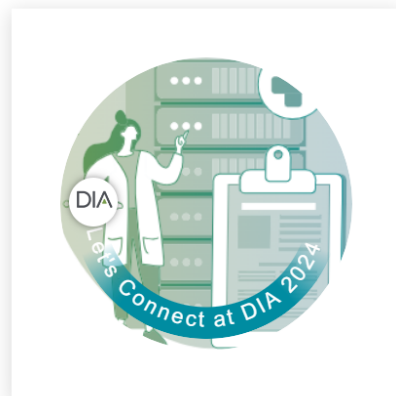
Replace your photo

Once you have selected your photo, you can select your statement, logo, and use the sliders to manipulate where the statement and logo appear on your profile picture-the preview will update in real time as you move things around.