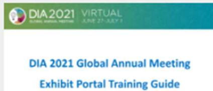
Exhibit Portal Training Guide

https://www.diaglobal.org/en/flagship/dia-2021/exhibits/exhibitor-resource-center