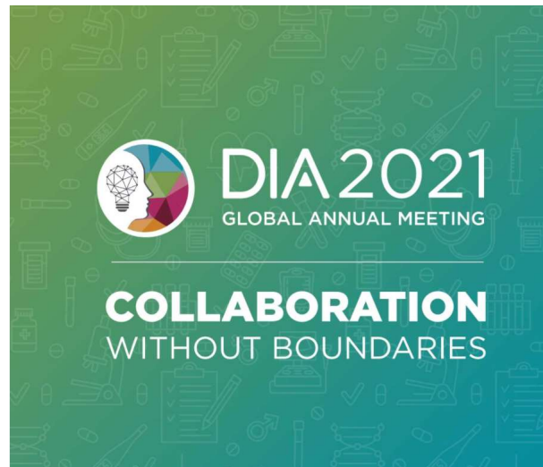
Exhibit Portal URL:

https://dia2021.mpeventapps.com/sponsor-portal/