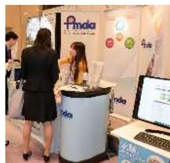
※ Booth sample of 2019 year's