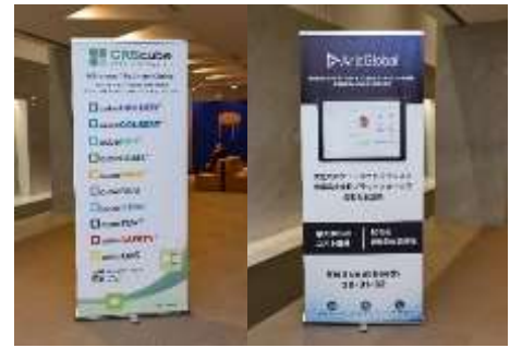
※Self stand sample of 2019 year's