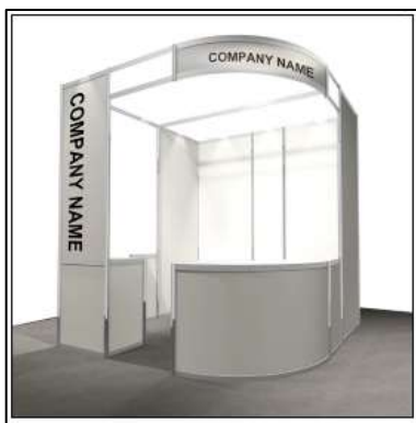
¥146,500 (Included Tax)