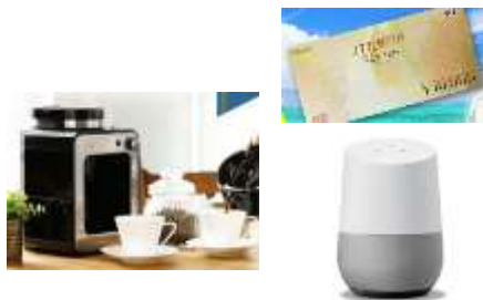
2019 year's awards

※ Gold sponsors may participate in this promotion free of charge.