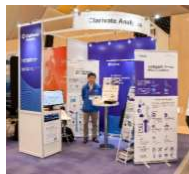
※ Booth sample of 2019 year's