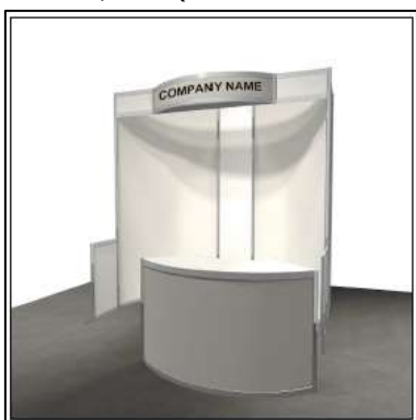
¥123,500 (Included Tax)