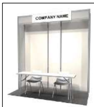
¥17,000 (Included Tax)