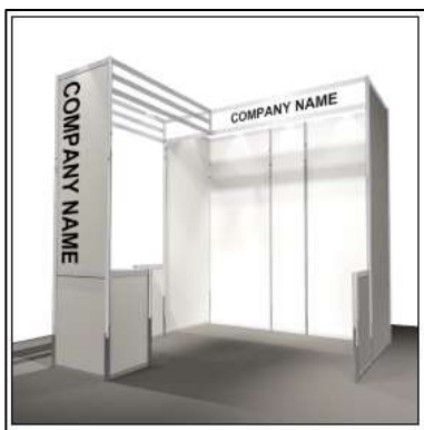
¥196,500 (Included Tax)