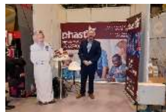
※ Booth sample of 2019 year's

Please order your booth construction to e-mail : DIAexhibit@advantage-inc.jp