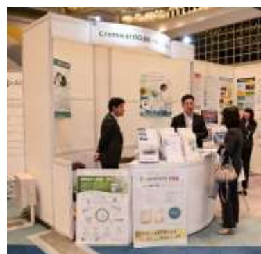
※ Booth sample of 2019 year's