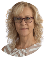
Senior Director, Regulatory Submissions AbbVie, Inc., United States