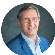
Clinical Trials Information System