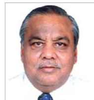
Ashok Kumar Secretary, Department of Pharmaceuticals, Government of India